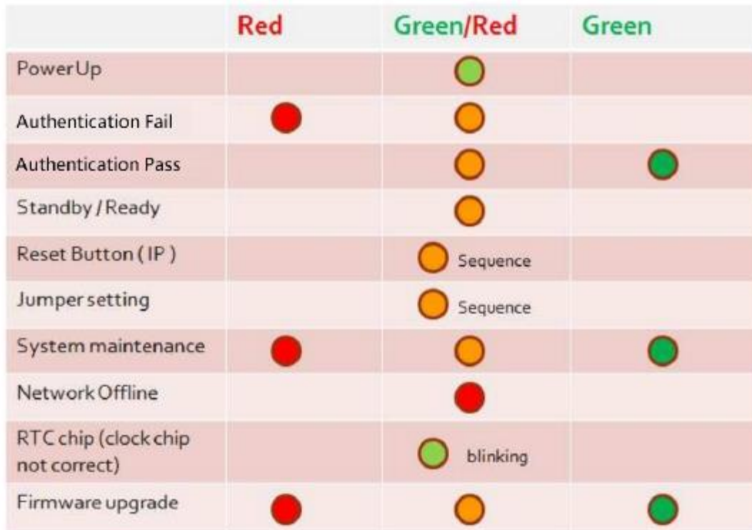
Table guides on how the three (3) LED lights behaves in three (3) different colour.