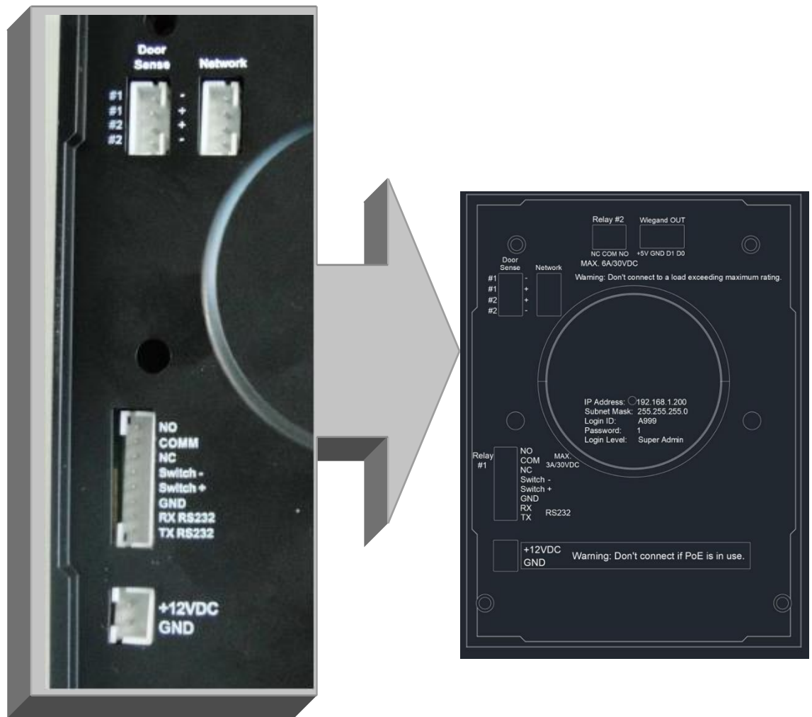
ACTAtek External IP Smartcard Reader back panel and ports